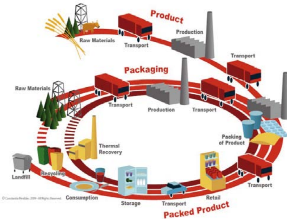
© Constantia Flexibles 2009. All Rights Reserved.

"Constantia Flexibles is a leading group of flexible packaging companies supplying customers worldwide in the food, pet food, beverage and pharmaceutical industries.